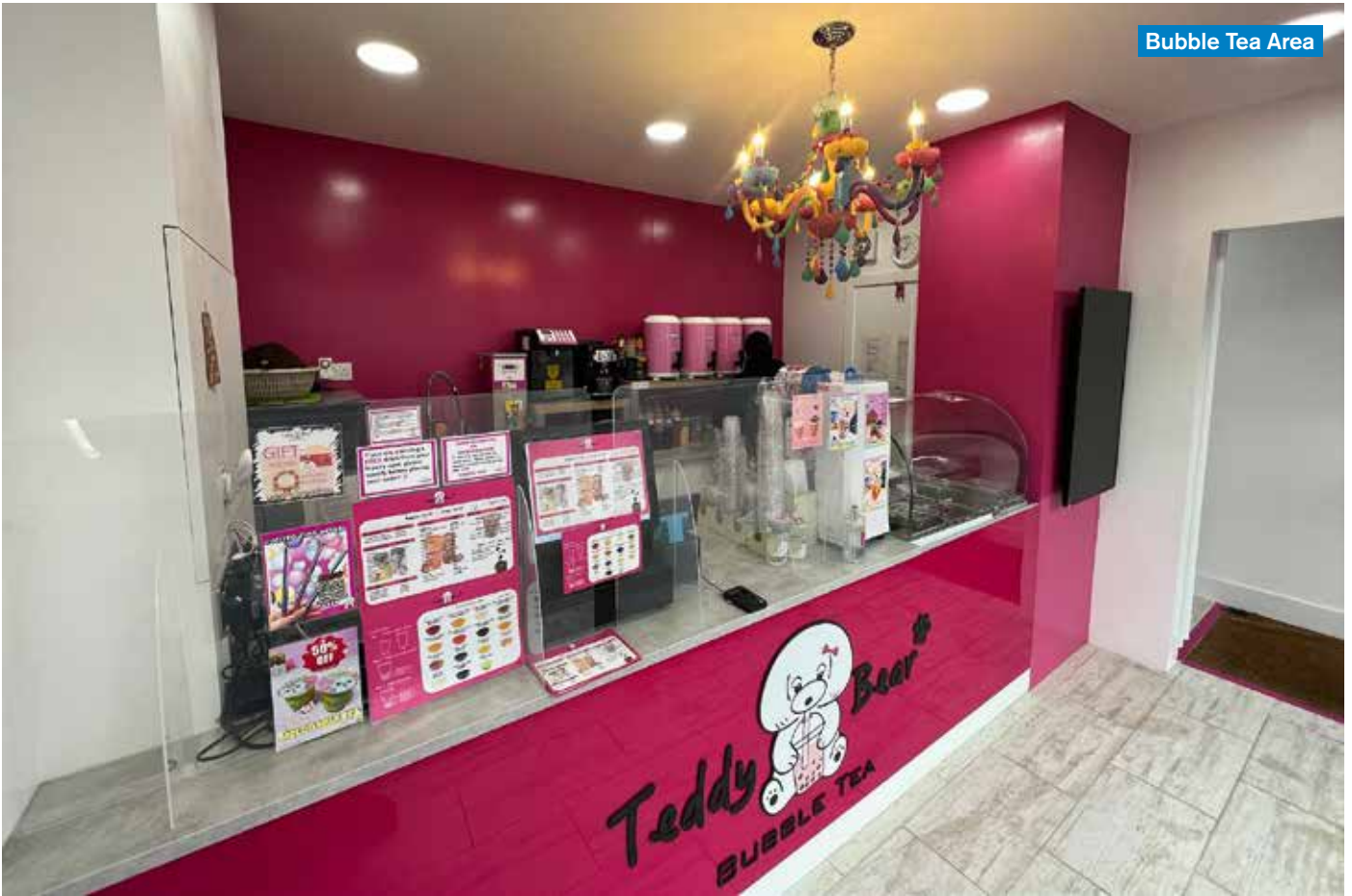
Bubble Tea Area