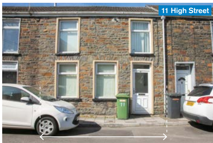
11 High Street