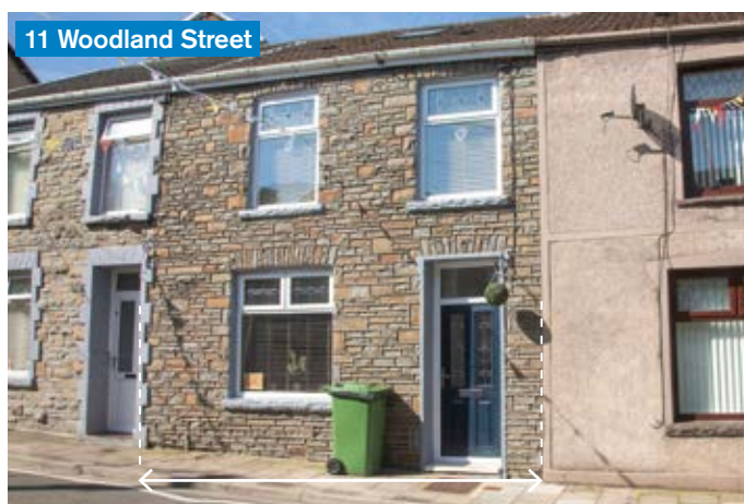
11 Woodland Street