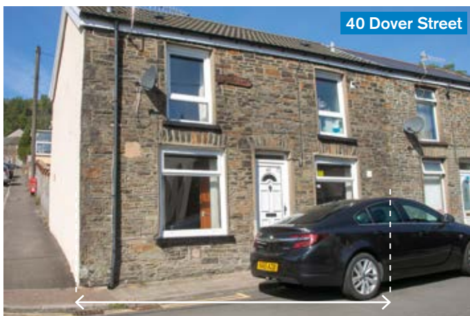
40 Dover Street

First time on the market for over 38 years Portfolio of 39 Ground Rent Investments each with Valuable Reversions