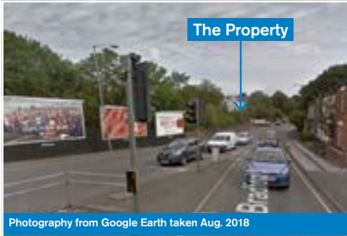
Photography from Google Earth taken Aug. 2018