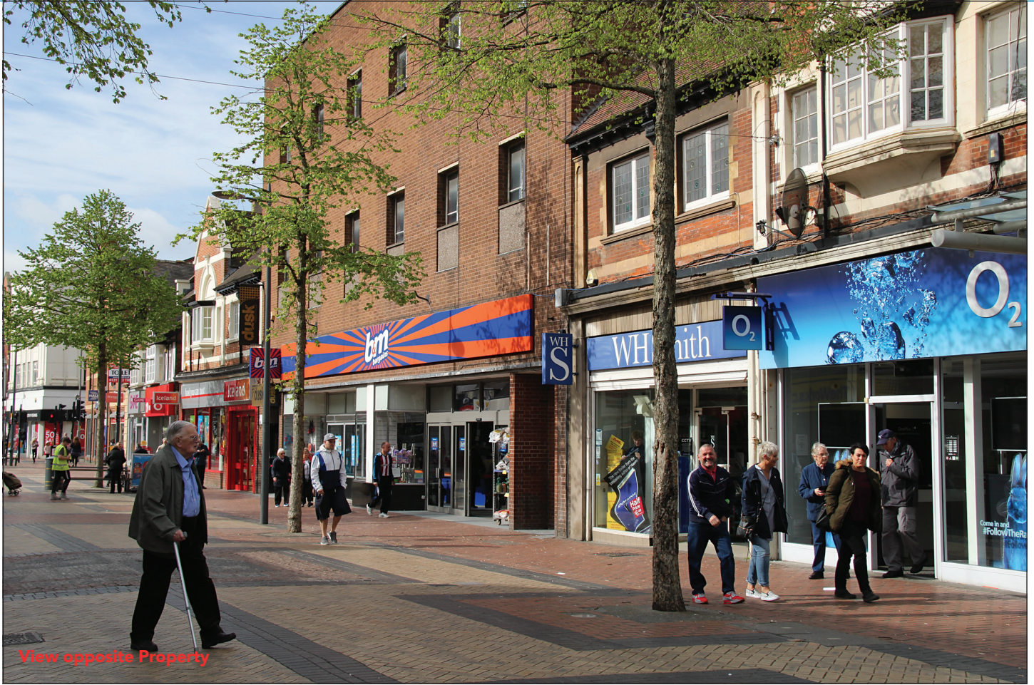
View opposite Property