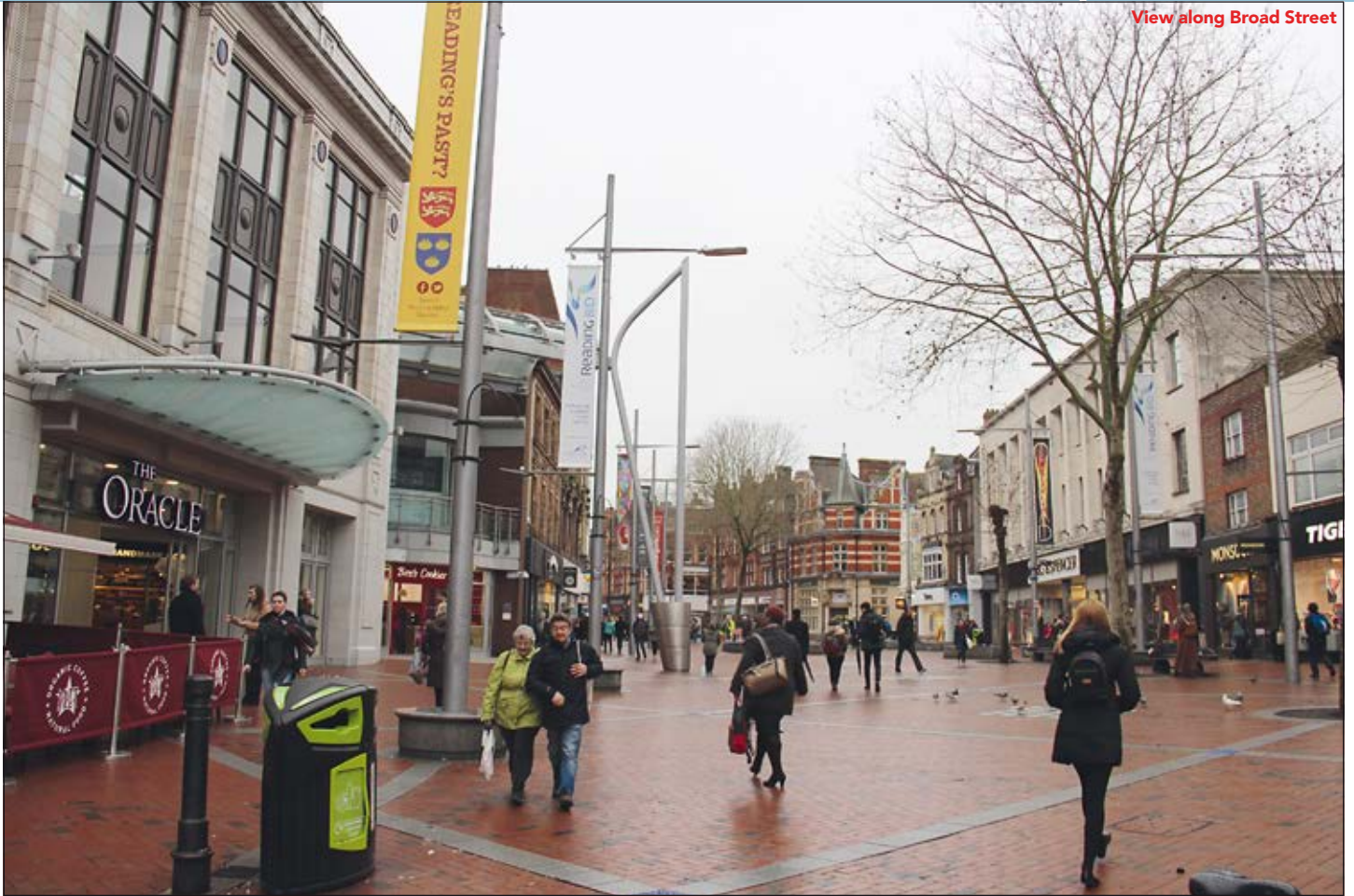
View along Broad Street