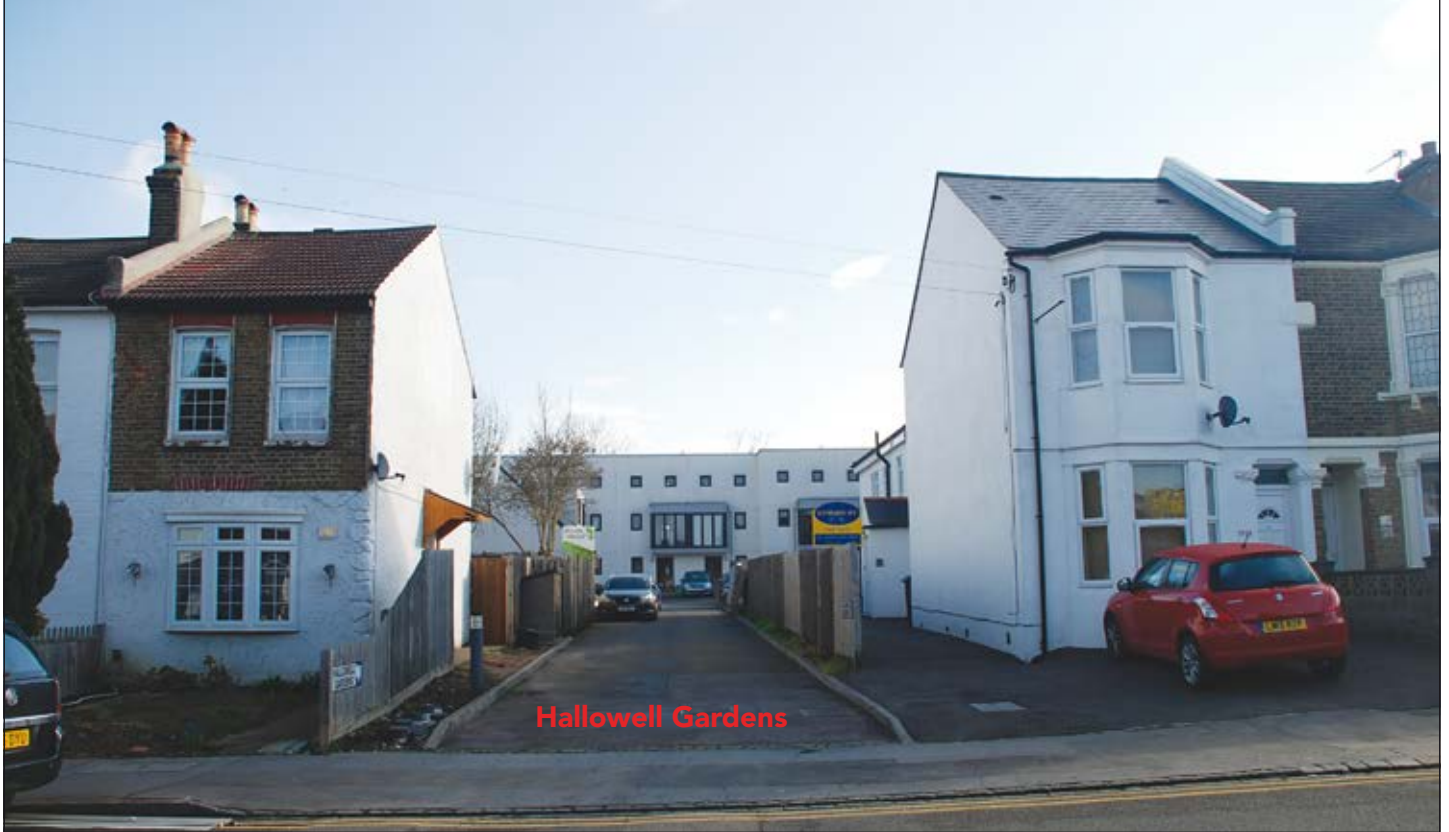
View from Parchmore Road