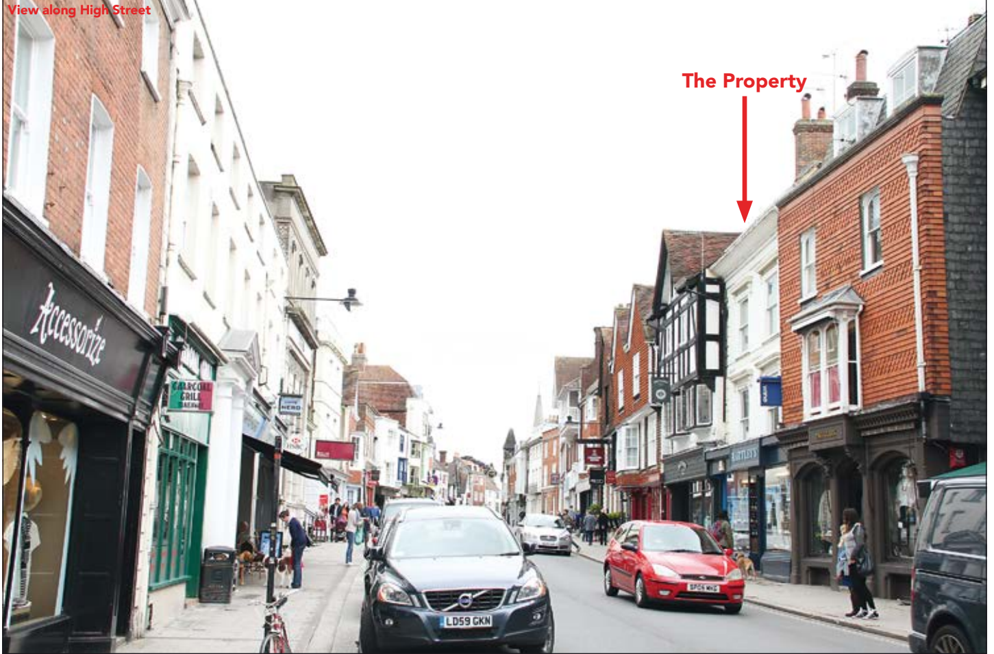
View along High Street