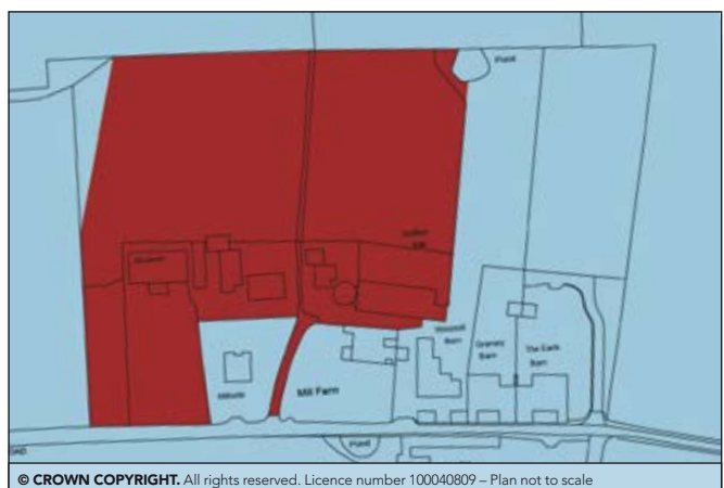
© CROWN COPYRIGHT. All rights reserved. Licence number 100040809 – Plan not to scale