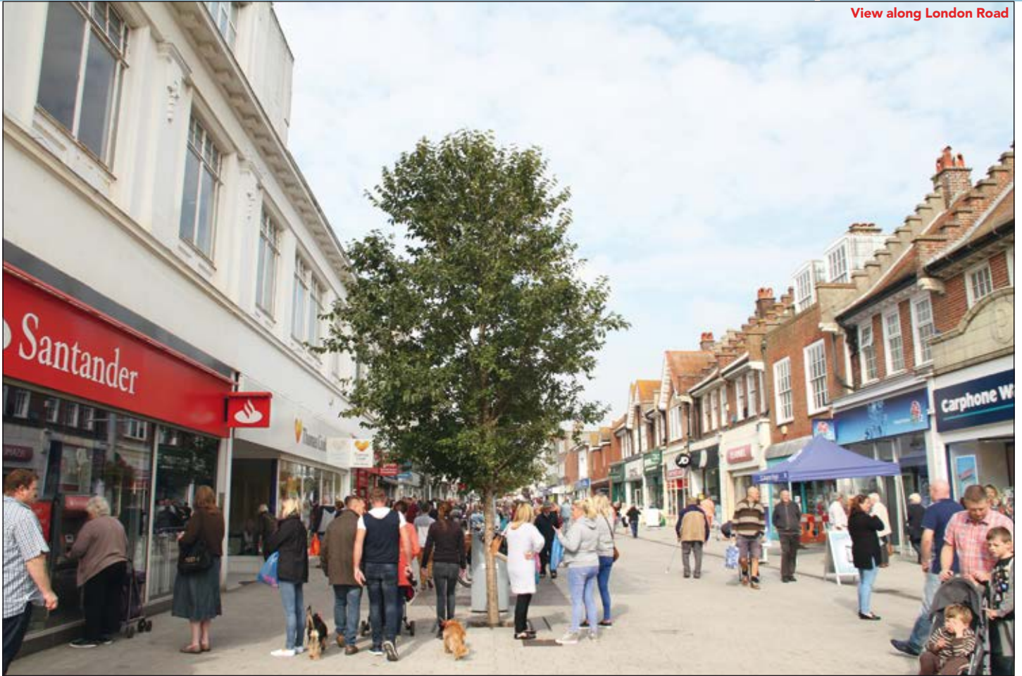
View along London Road