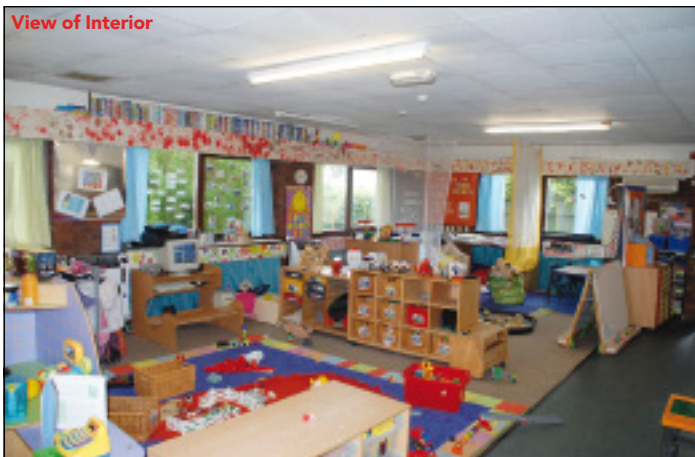
View of Interior