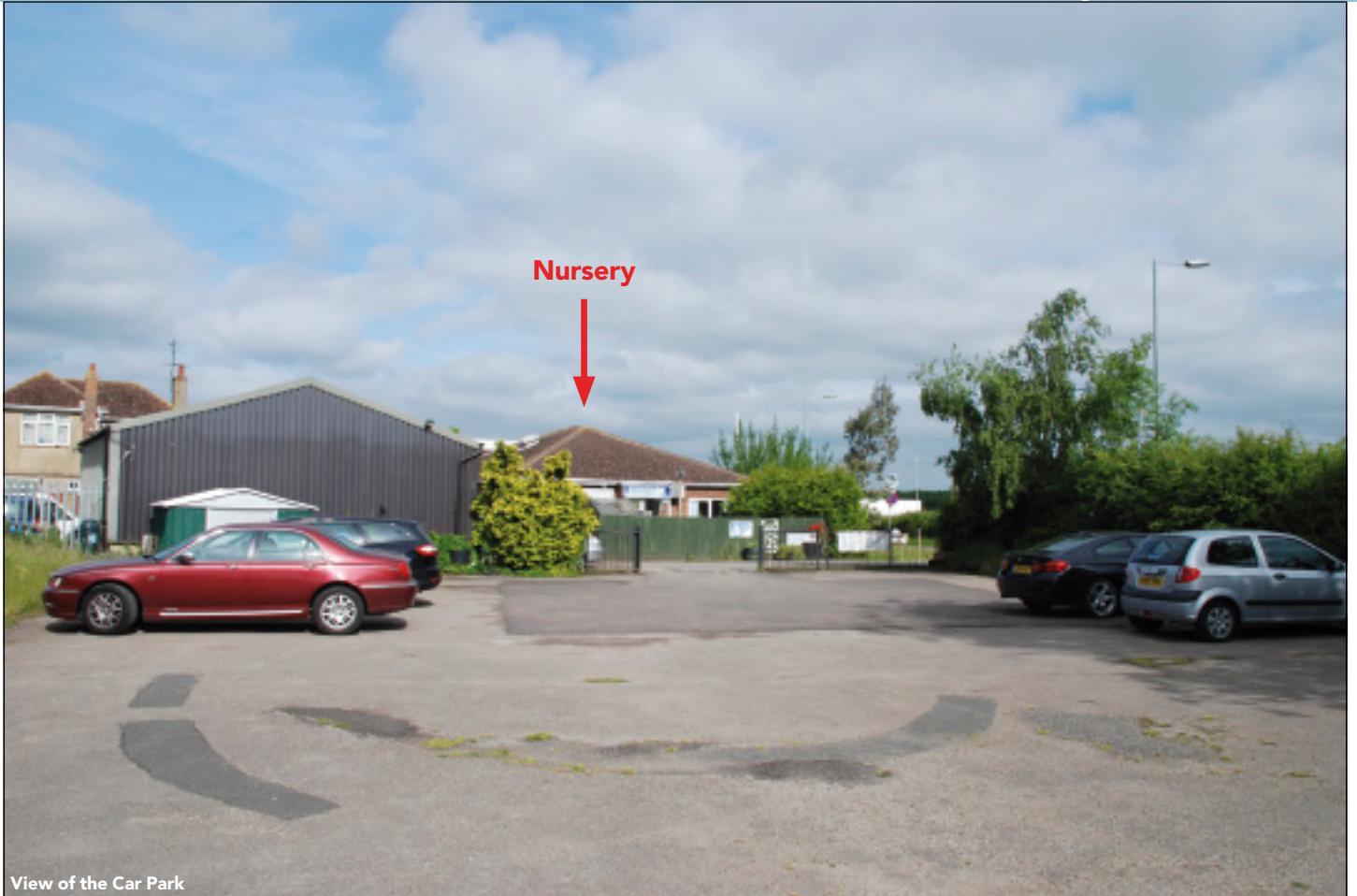
View of the Car Park