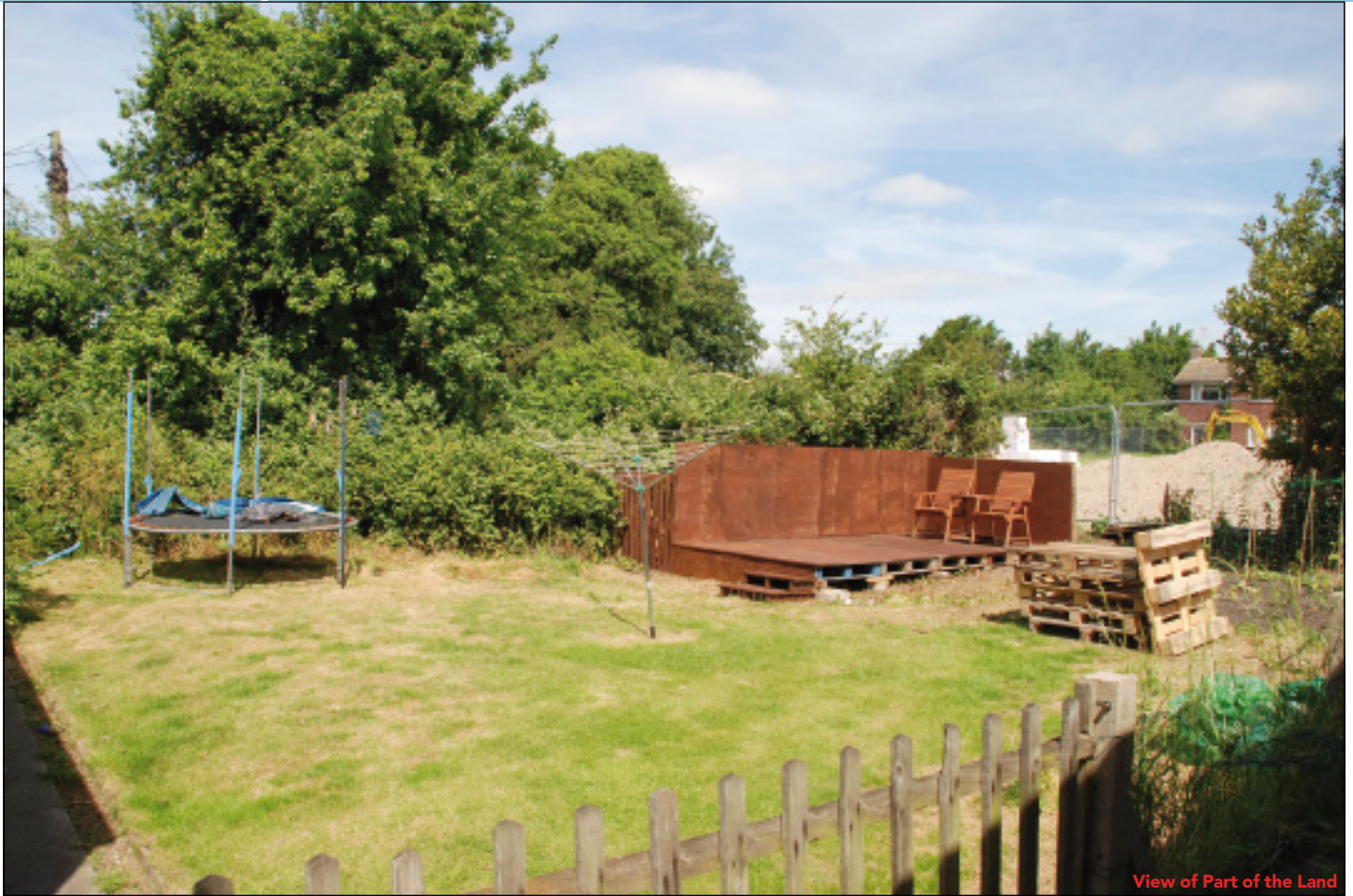
View of Part of the Land