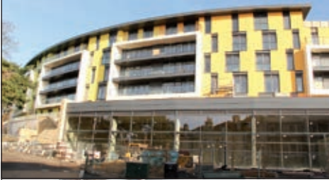
New Development Diagonally Opposite