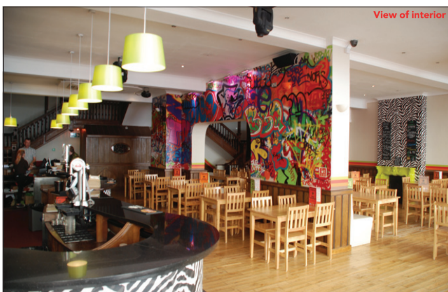
View of interior

The Surveyors dealing with this property are MATTHEW BERGER and NICHOLAS BORD