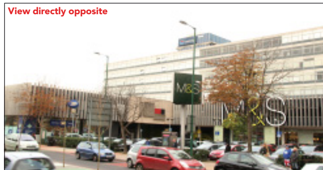
View directly opposite

Note 2: We understand that the lessee sublets the Flat on an AST.