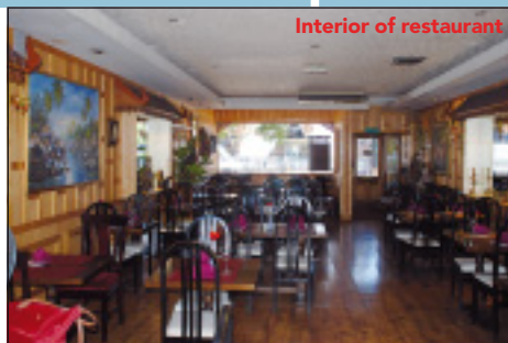
Interior of restaurant