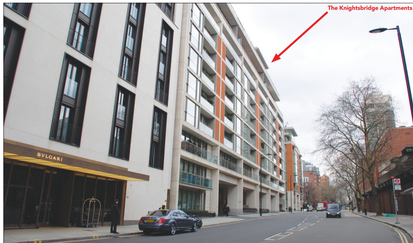
The Knightsbridge Apartments

The Licensee of the parking space must own property in the SW7 postcode which is within the boundary edged red on this plan.