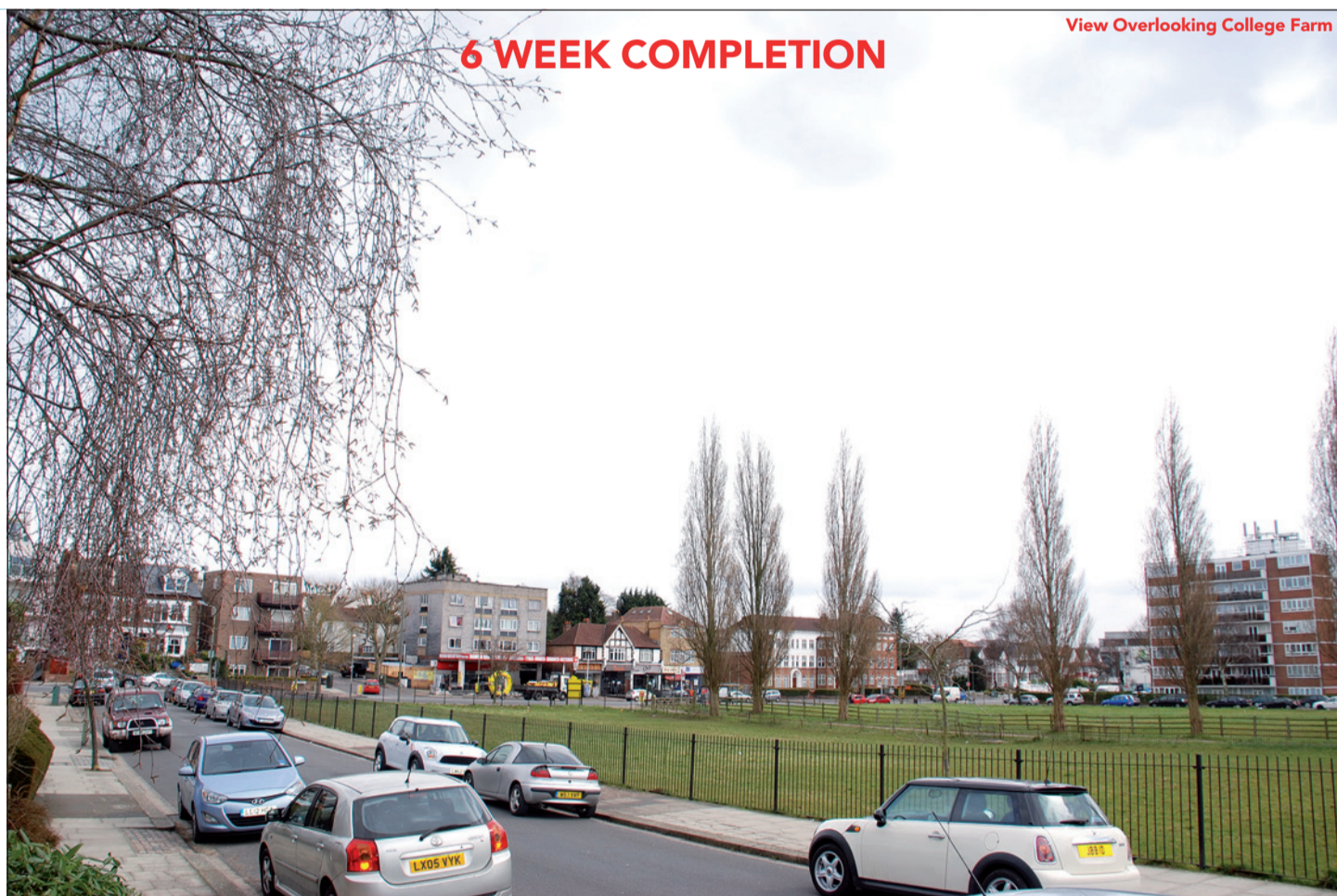
View Overlooking College Farm