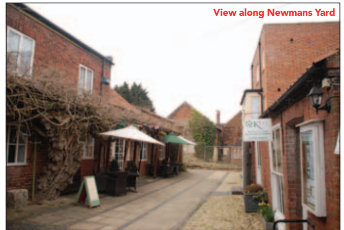
View along Newmans Yard

FREEHOLD Offered with FULL VACANT POSSESSION