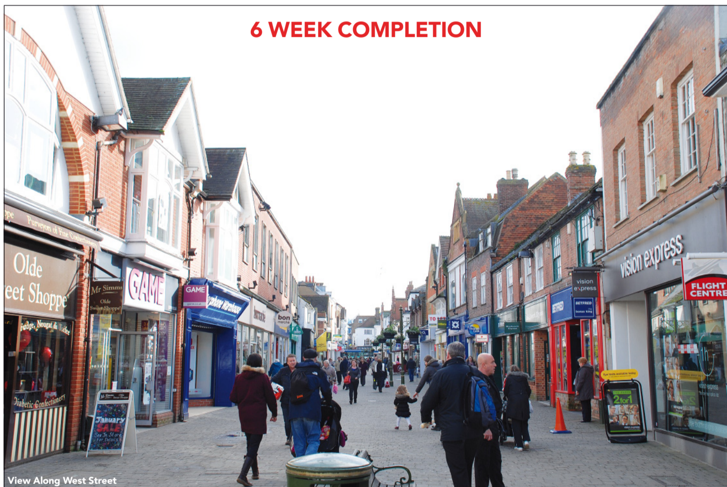
View Along West Street

Rent Reviews & Tenant's Breaks 2015 & 2020