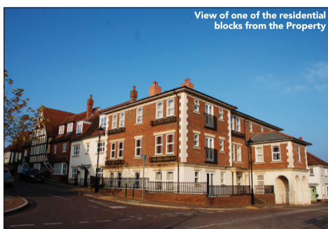
View of one of the residential blocks from the Property