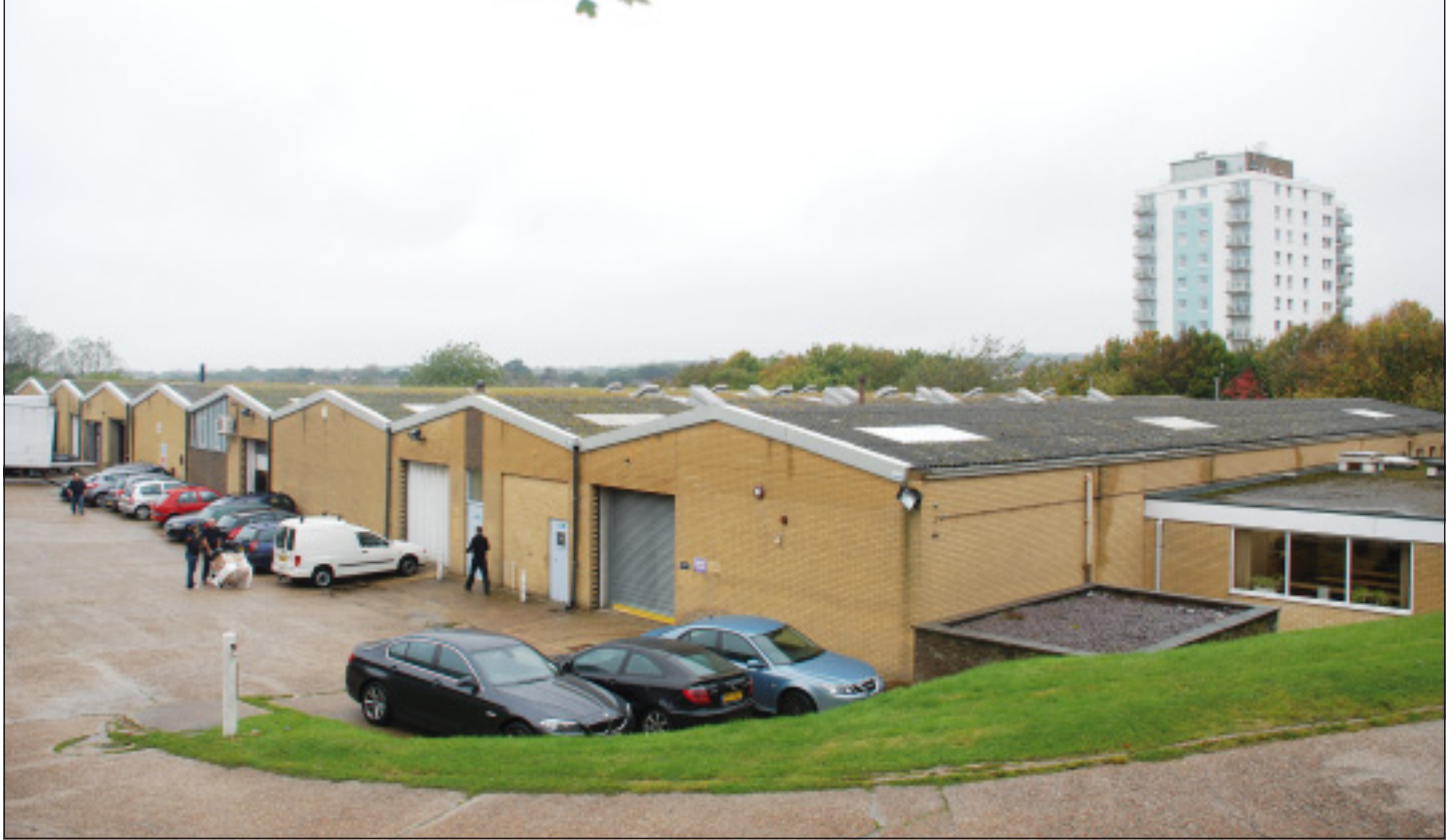
Factory Block B