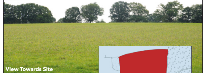
View Towards Site